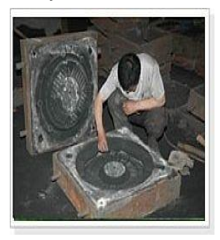
Fig. 3: A metal caster inspecting a sand mould

Foundries also employ sodium bentonite to clear impurities from melted metals before pouring them. A typical casting sand mould which is being inspected by a metal caster is shown in Figure 3.