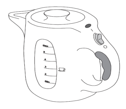
Figure 1.: Plastic jug kettle

c) Figure 1 shows a plastic jug kettle and its base unit