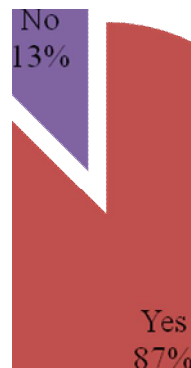
Fig 2: Participation in Extra Tuition

Parents were asked to indicate if their children participated in extra tuition by stating 'yes' or 'no'. The parents' responses are reflected in figure 2.