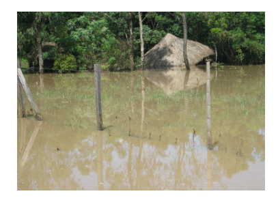
Figure 4: Challenges faced the communities settled in the Budalangi flood plain. Photo 1 is courtesy of UNEP/GoK survey July 2003. Other photos are from field Dec 2006.

Within the Budalangi area, the nature of extreme events is seen from the time series image analysis. The extent of the 2003 flooding for example is seen in the 2003 imagery (Figure 3). Analysis of the 1997-2001 Busia Development Plans and Poverty Reduction Strategy Papers indicate that there was dismal implementation of the plans with high rate of failure of poverty reduction programmes. The plans showed that financial constraints led to only 30% of the plan being implemented. Other plans have failed before. For example, the revitalisation of the