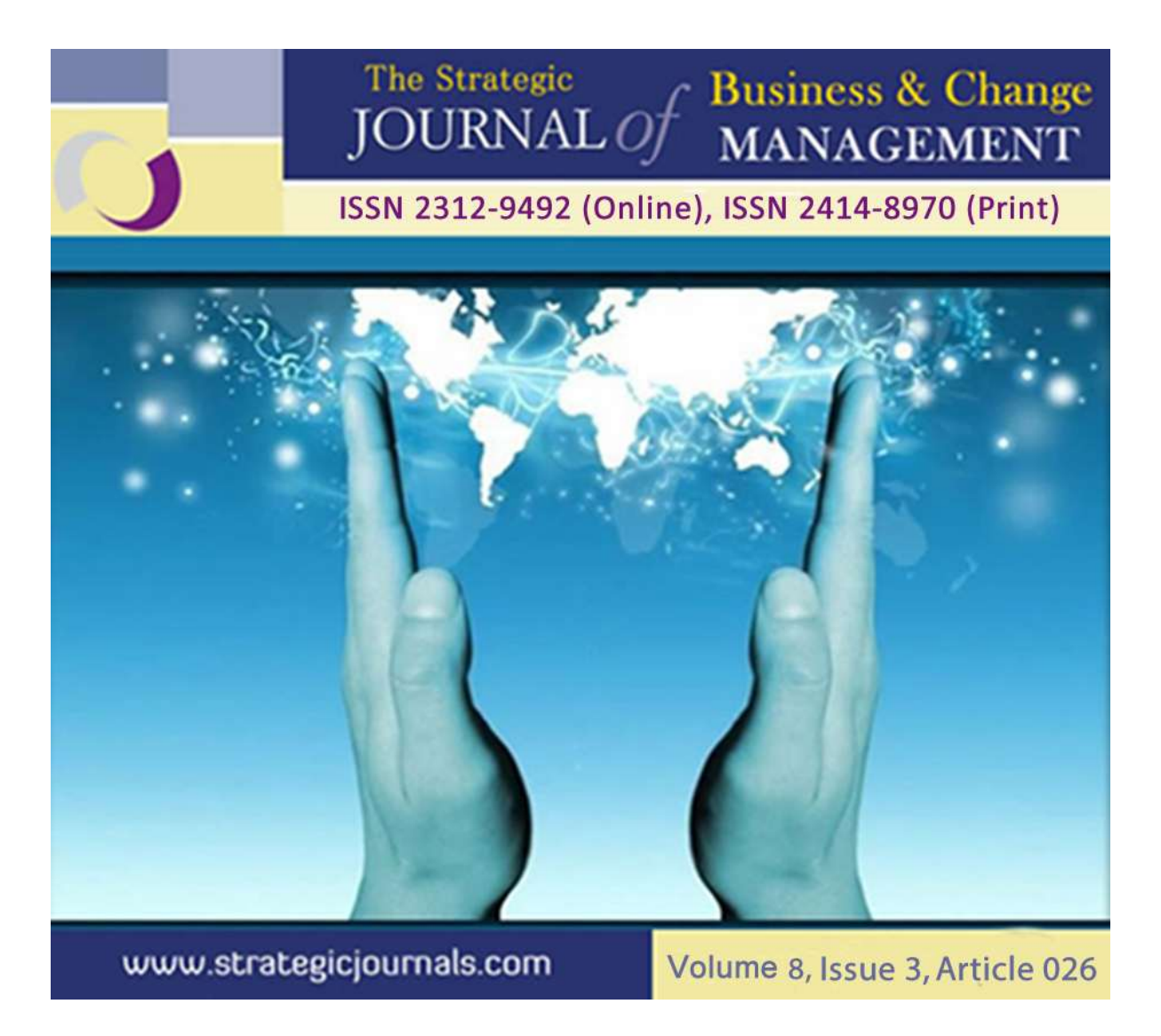
SUSTAINABLE SUPPLY CHAIN MANAGEMENT AND ITS EFFECTS ON THE PERFORMANCE OF SUGAR SUB-SECTOR IN KENYA